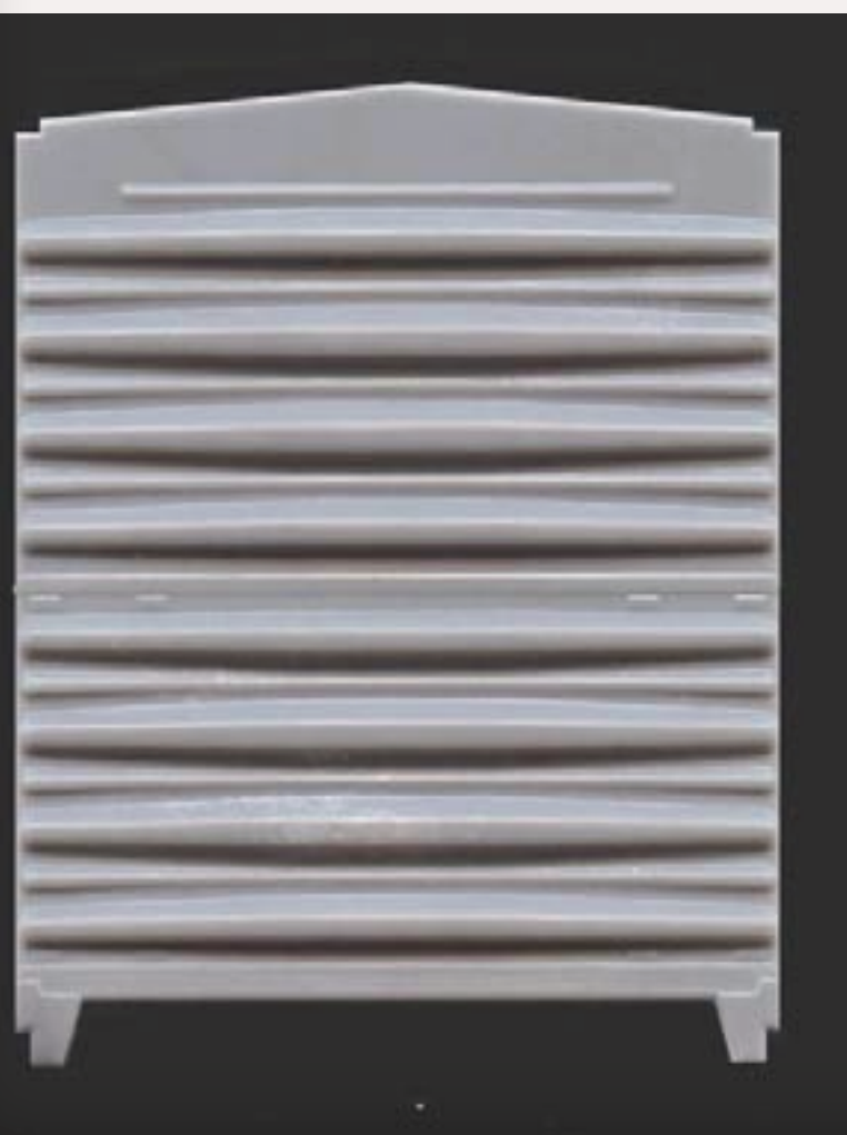
FIGURE 2: Cannon and Company has introduced an accurately-detailed Plate C End for contemporary boxcars. Known primarily as a manufacturer of highly-detailed molded styrene parts for modifying HO scale diesel bodies, this is Cannon's first freight car component. Aimed at prototype modelers, the new parts are sold direct only. For additional information visit: shop.cannonandco.net

SP officials raised the boiler pressure and eliminated the streamline casing on its highly successful GS-2 class 4-8-4s resulting in the equally-successful GS-6 (numbers 4460-4469) that Lima delivered in 1943.