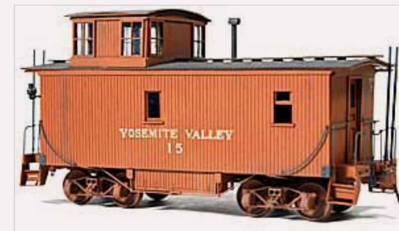
FIGURE 8: Jack Burgess built this O scale model of Yosemite Valley caboose #15 using a stock kit from Mullett River Model Works ( www.mulletrivermodelworks.com ). Jack measured the prototype during restoration and prepared the drawings that Mullett River utilized in developing the laser-cut kit.