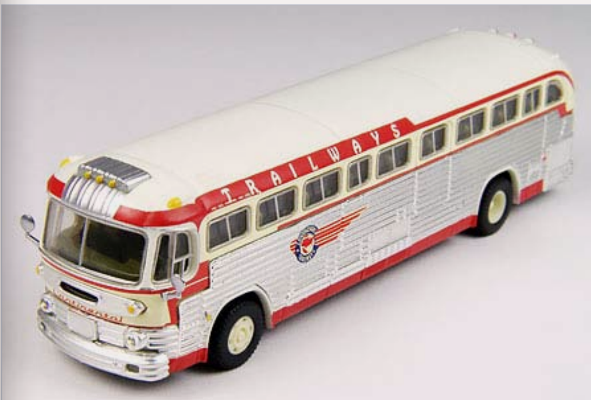
FIGURE 4: This good looking HO scale Trailways bus is scheduled to arrive at dealers this month from Classic Metal Works ( www.classicmetalworks.com ). The cast metal HO scale model is based on the 1950s-era Trailways Luxury Liner model PD4103. Models

Each decal set includes enough material to letter three different cars in various schemes for each road. HO scale models from Athearn, Walthers, Eastern Car Works and Con Cor are suitable for this application.