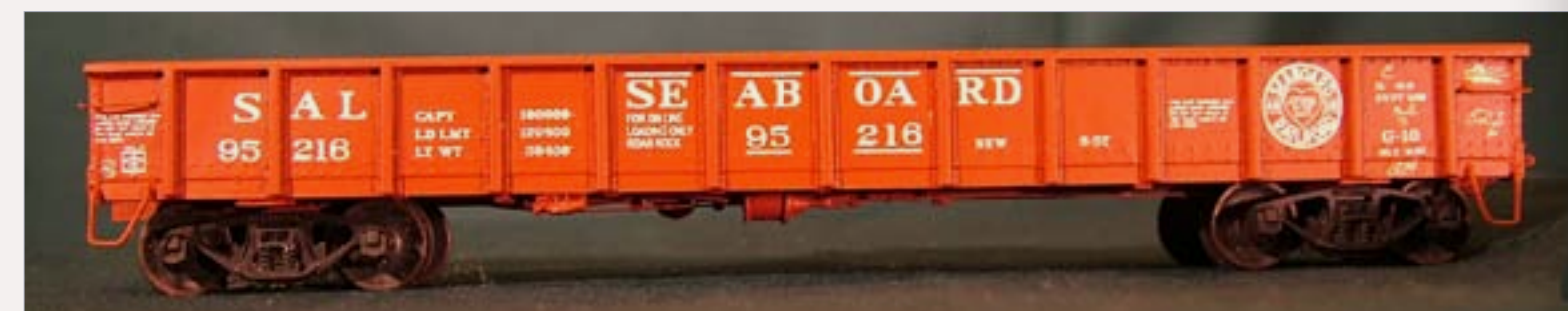
FIGURE 17: WrightTRAK Models will soon introduce this HO scale Seaboard Air Line (originally Norfolk Southern and Macon Dublin & Savannah) low side gondola as a cast resin kit. Metal etchings for crossover steps and brake gear will be included along with Tichy brake gear and trucks. Decals for SAL and MD&S are ready while work on the NS decals is nearing completion. For ordering information visit www.wrighttrak.com .