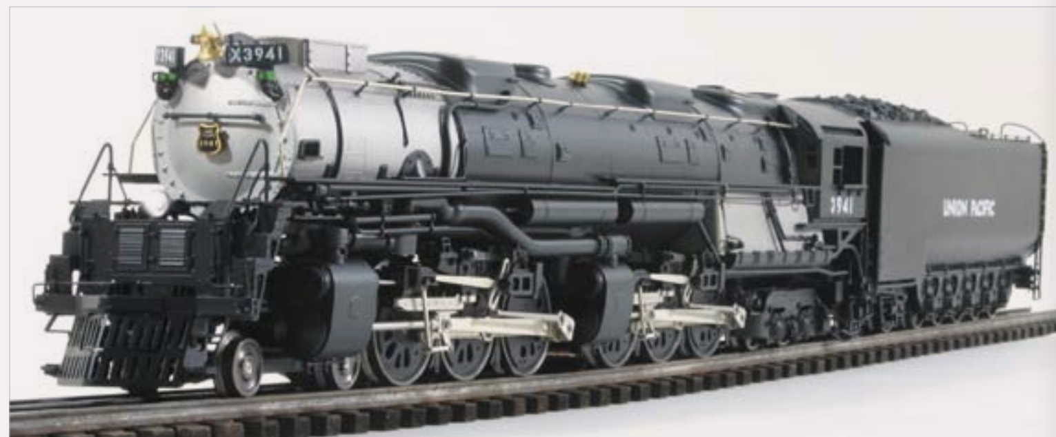
FIGURE 1: 3rd Rail Division of Sunset Models is accepting reservations for an O scale Challenger steam locomotive that will be decorated for Union Pacific, Rio Grande, and Clinchfield plus the contemporary look of today's restored Challenger. The handcrafted brass models will be available for two-rail operation and as a three-rail version compatible with 0-72 track. The models will feature TMCC/ Railsounds 4.0 and will be compatible with Legacy, DCS, TMCC and conventional control systems. For additional information or to reserve go to www.3rdrail.com .

The HO scale Genesis locomotive lineup scheduled for March arrival includes an SD70MAC decorated for Alaska Railroad, Burlington Northern, CSX and BNSF. Also various combinations of F7A and F7B units decorated in Santa Fe's Yellow Bonnet scheme. Genesis locomotives going to dealers in May will include a GP15-1 with Tsunami sound and DCC quick plug decorated for MP, C&NW, SLSF and CR and a similarly equipped GP15T for C&O