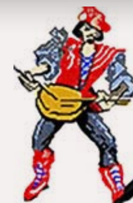
FIGURE 3: Since 1975 Con-Cor has produced both HO and N scale special Collector's Christmas Cars. This year the car will be the 12 Drummer Car which completes Con-Cor's 12 Days of Christmas series. Art work was incomplete at press time, however the decorating scheme will center around the festive character seen here. The limited-edition cars will be available at the end of November and may be ordered at www.con-cor.com/Xmas.html .

Fox Valley Models ( www.foxvalleymodels.com ) is quoting December delivery on several N scale versions of SOO 7-post boxcars including SOO Line in boxcar red with dotted frame stripes, SOO Line with white ends and large letters (without color mark), CSX in blue with yellow reporting marks, Great Northern decorated in big sky blue, and BNSF with circle cross.