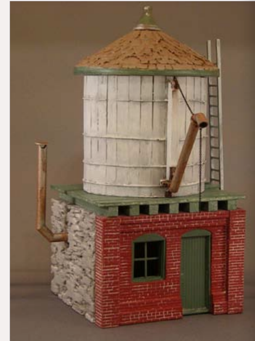
FIGURE 12: Schomberg Scale Models ( www.schombergmodels.com ) is developing this branch line water tank into an O scale kit to be called Garden Hill Tank. The stone structure, fancy brick front and rugged shake shingles lend themselves to some imaginative, funky weathering. I see hobos, barking dogs and lush vines fed by a leaky, water stained tank. No word yet on price or availability.

A tip of the hat to Brian Leppart of Tahoe Model Works whose HO scale trucks continue to earn broad acceptance among the tough prototype police.