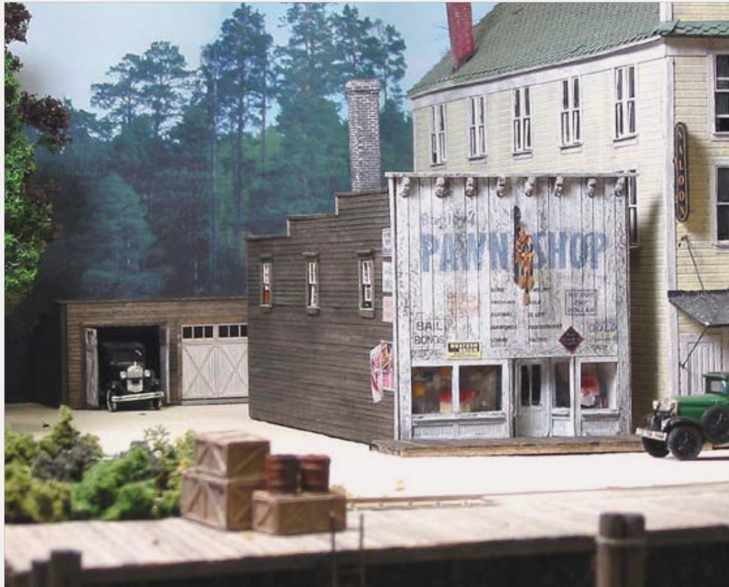
FIGURE 11: This Pawn Shop and garage is the latest HO scale craftsman kit from Rusty Stump Limited ( www.rustystumps.com ). The finished model measures 22-feet wide by 50-feet deep by 20-feet high. That's a foot print on your layout of about 3 by 6-3/4 inches. The craftsman style kit has laminated walls of 1/32-inch plywood topped with exterior walls of laser cut Northeastern clapboard siding. Sheets of RSL's own black tarpaper (see MRH page 17 April 2009) are supplied for the roofs of both buildings. Several decals and signs are included as well as an assortment of detail resin castings for the front windows and door. A few pawned items are provided to display in the shop window.

To replicate the look of the prototype, each model sign has a core of .008-inch etched stainless steel that closely resembles the look of oxidized aluminum of the prototype. Black urethane castings included in the kit are glued to each side of the etched post. Decals to create the various signs are included.