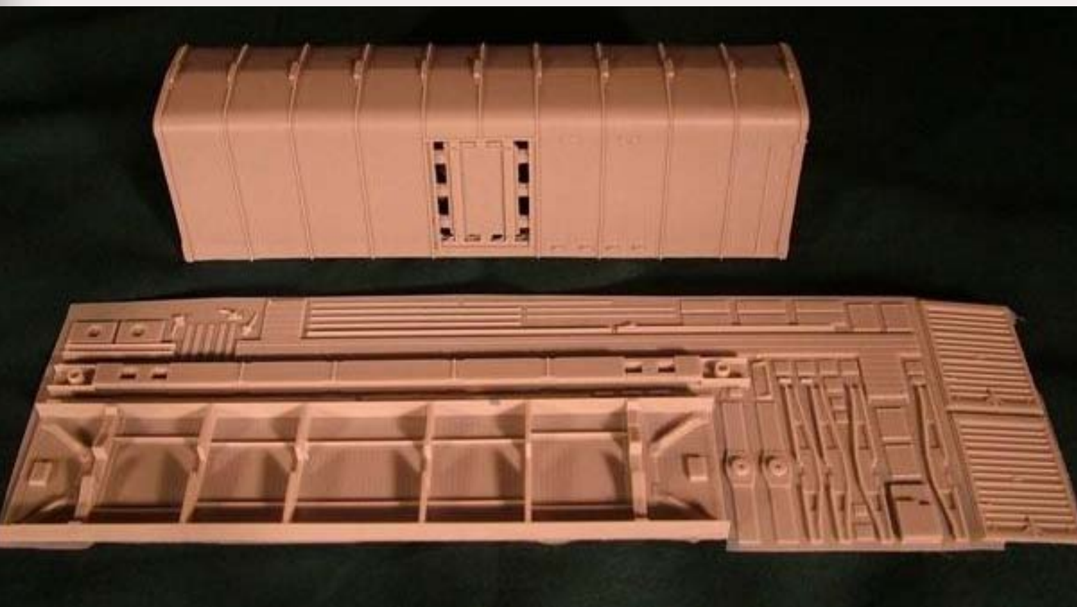
FIGURE 13: This is a preliminary test shot of the new B&O class M53/M53A Wagontop boxcar WrightTRAK Models ( www.wrighttrak.com ) introduced in late October at the Naperville RPM meet. In addition to the one-piece resin body, the HO scale kit includes a Duryea underframe, Tichy brake gear and trucks, and specially-prepared decals that cover several different paint schemes during the life of the distinctive M53 cars. Production of the resin castings is being handled by Jim King of Smokey Mountain Model Works.

with added safety appliances and other modifications subsequent to the as-built versions previously offered by Westerfield.