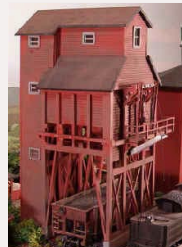
FIGURE 7: Kanamodel Products expects to begin shipping its HO scale Canadian National 100-ton Coal Plant before the end of November. Laser cut walls and some 3000 scale feet of scale lumber are incorporated into the design of this craftsman kit that includes Grandt Line nut-bolt-washer castings. Windows, doors, coal chute, pulleys and other cast details are included along with comprehensive instructions. The footprint of the structure is 4 x 5-inches but a depth of at least 7 inches is required over the track. Visit www.kanamodel.com for ordering details.

IMRC has also announced decorating schemes for the initial release of its new closed-side version of a 1958 cubic foot two-bay hopper car. Roads for the HO scale assembled hoppers include ATSF, Chicago & Eastern Illinois, Chicago Great Western, Erie, SSW-Cotton Belt and Southern Pacific. An undecorated kit will also be included in the release. For those in need of more immediate gratification, IMRC will release an undecorated kit of its HO scale Plywood Panel boxcar this month.