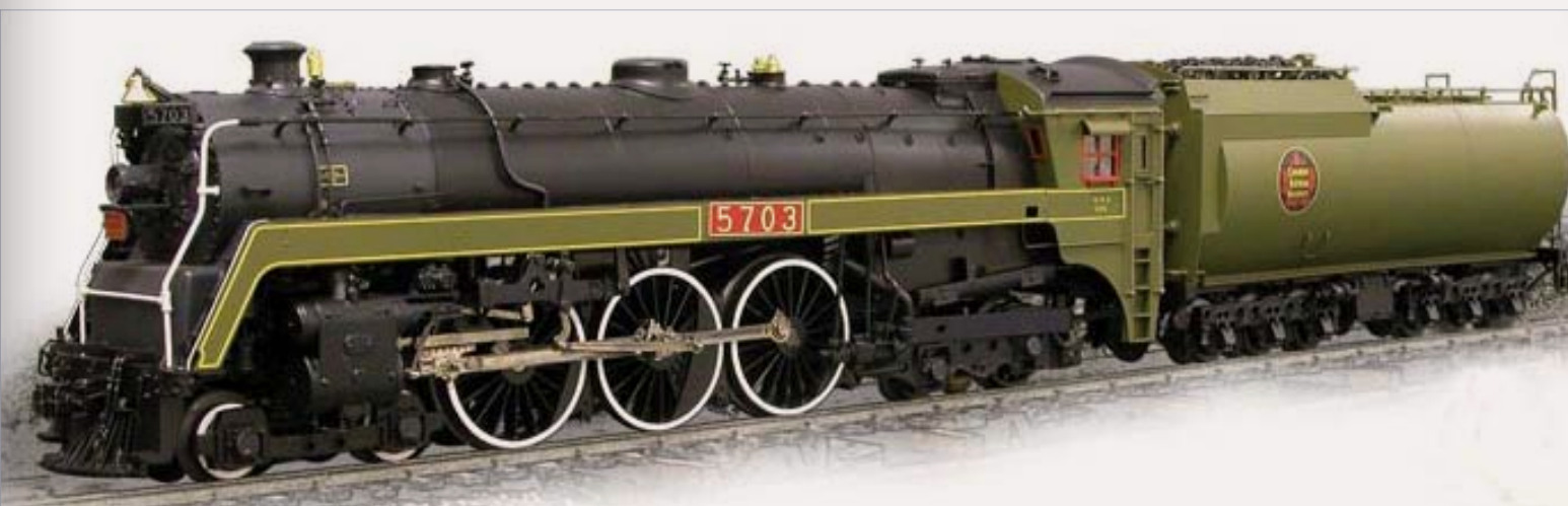
FIGURE 16: Weaver Models ( www.weavermodels.com ) will begin delivery of this handsome Canadian National 4-6-4 class K5a locomotive late this fall. The O scale limited-edition model will be offered with RailSounds and TrainMaster Command Control in both 2-rail AC and 3-rail AC versions at $1095. A standard 2-rail DC model is priced at about $995.