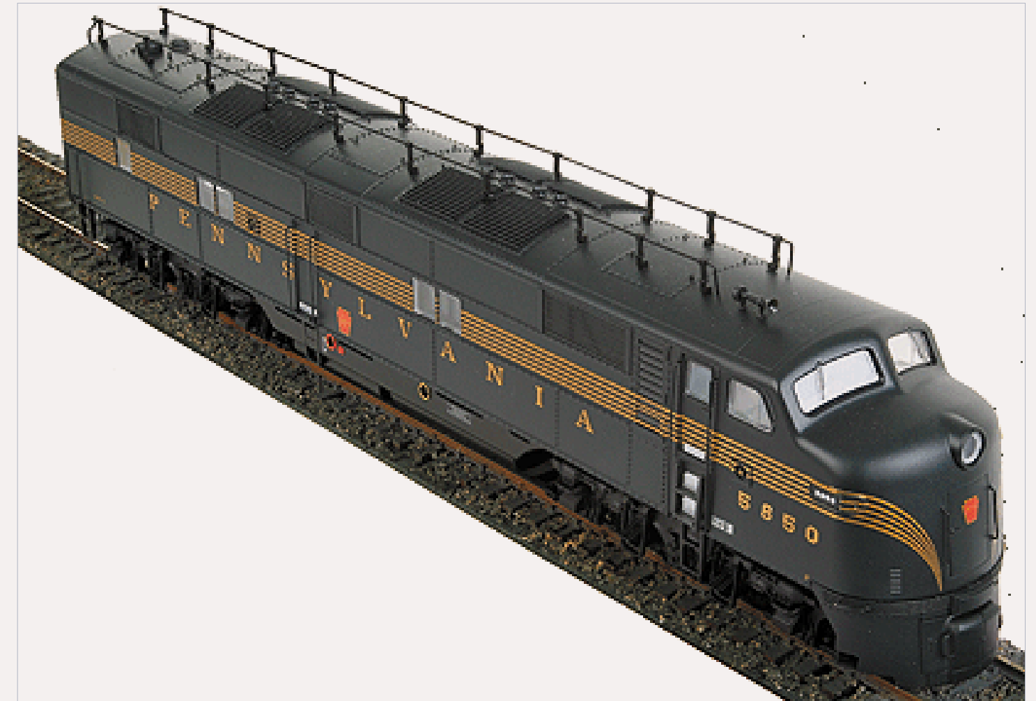
FIGURE 14: Walthers 2000 Pennsylvania Railroad E7A .