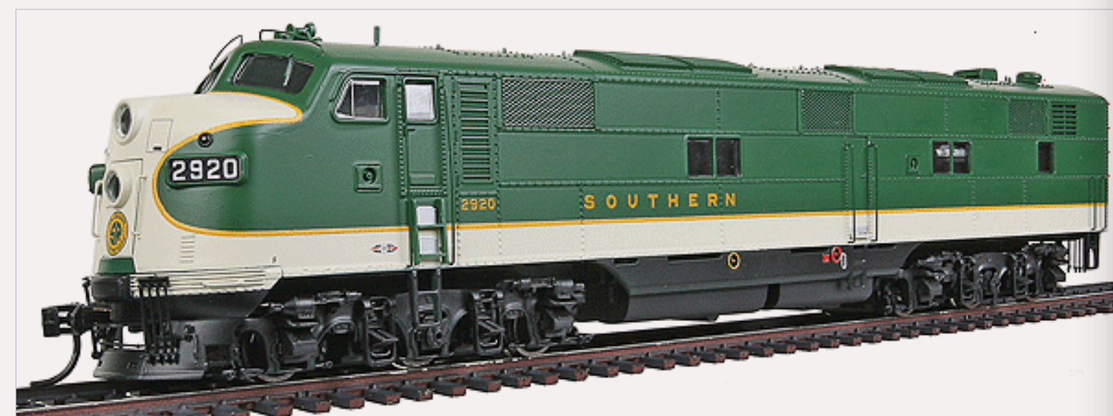
FIGURE 15: Walthers 2000 Southern Railway E7A .