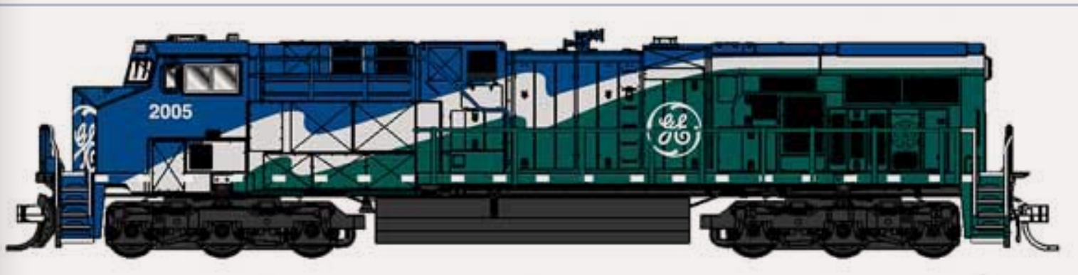
FIGURE 6: InterMountain Railway Company is taking dealer reservations for March/April delivery for its new HO scale GE ES44AC Evolution series locomotives. Six pre-2008 road name/schemes will be available including Union Pacific, Kansas City Southern, Canadian Pacific, Ferromex and BNSF, plus a GE demonstrator scheme. Both DC and DCC equipped versions will be produced.

The problem of finding the always-expensive tomes has been greatly relieved by RailDriver Cyclopedias